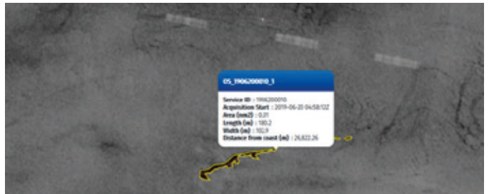
Satellite image: Sentinel-1