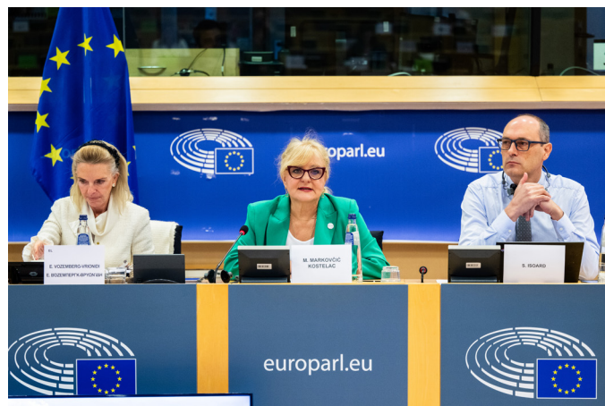
Our Executive Director presents the EMTER report to the TRAN committee at the European Parliament together with the EEA.