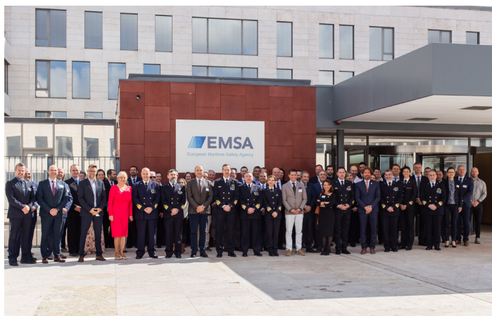
The European Coast Guard Functions Forum workshop, held at EMSA, and co-hosted by EMSA and the Italian Coast Guard, gathered delegates from all over Europe.